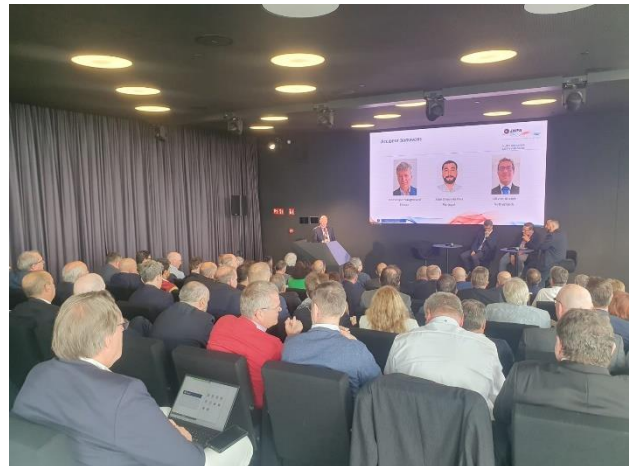
Figure 5 Accident Survivors