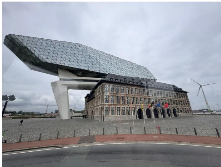
Figure 1 Zaha Hadid designed Port of Antwerp Building

The annual General Meeting convened at the architecturally striking Port House in Antwerp, designed by Zaha Hadid, serving as a testament to modern architectural prowess. The chosen theme, “Pilots for Safety - Safety for Pilots”, served to underscore the pivotal role we undertake in ensuring maritime safety and the effectiveness of supply chains. The event underscored our unwavering dedication and continual endeavours to uphold pilot safety while executing this critical yet indispensable service. It also sheds light on the perils inherent in our occupation and the available resources to ensure the utmost safety in our duties.