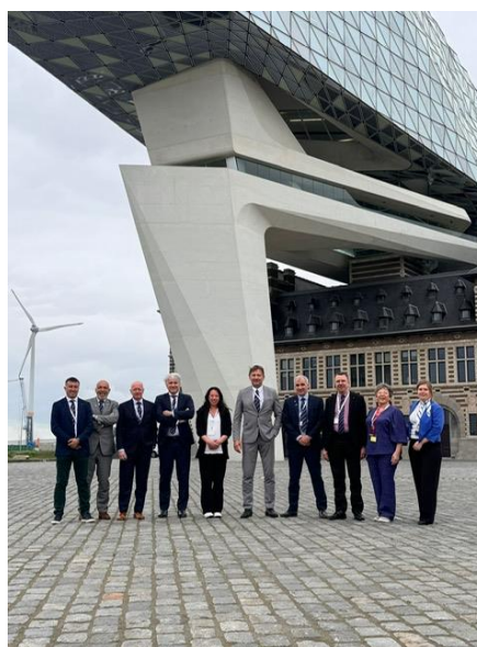
Figure 2 EMPA Board